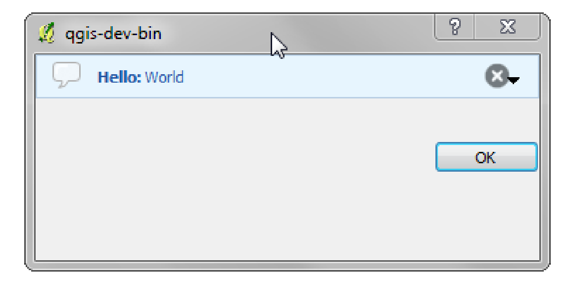
Figure 12.5: QGIS Message bar in custom dialog