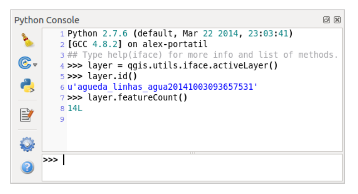
Figure 1.1: QGIS Python console

For scripting, it is possible to take advantage of integrated Python console. It can be opened from menu: Plugins \rightarrow Python Console . The console opens as a non-modal utility window: